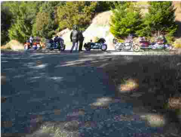
Rest Stop at Who-Knows-Where