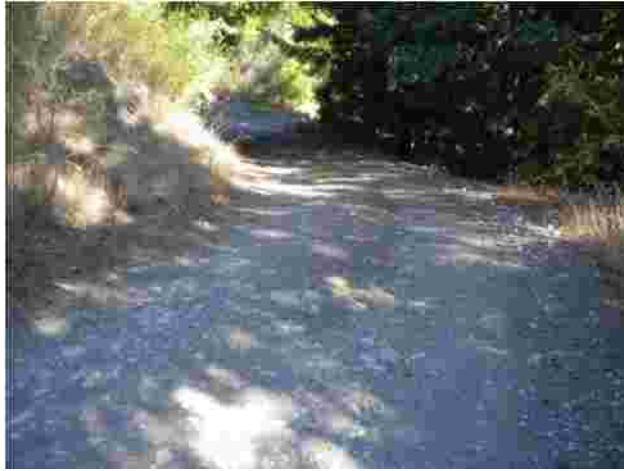
Typical Twisty-Turny Road