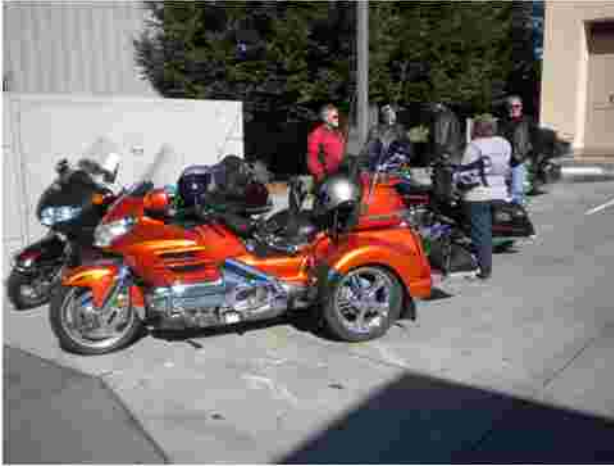
The Group, Less the Photographer