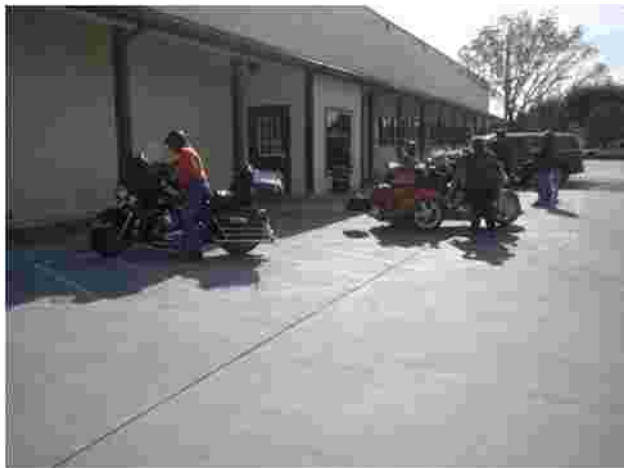
Lunch at Granzella's in Williams