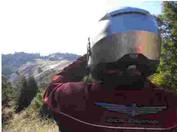
Ron Using the Stars to Find Our Location