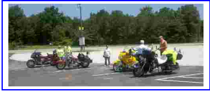
Sal & Patti at AL-M chapter ride