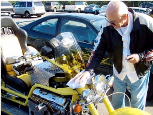
Jim sprung a leak and had to clean up and replace his anti-freeze along the way.