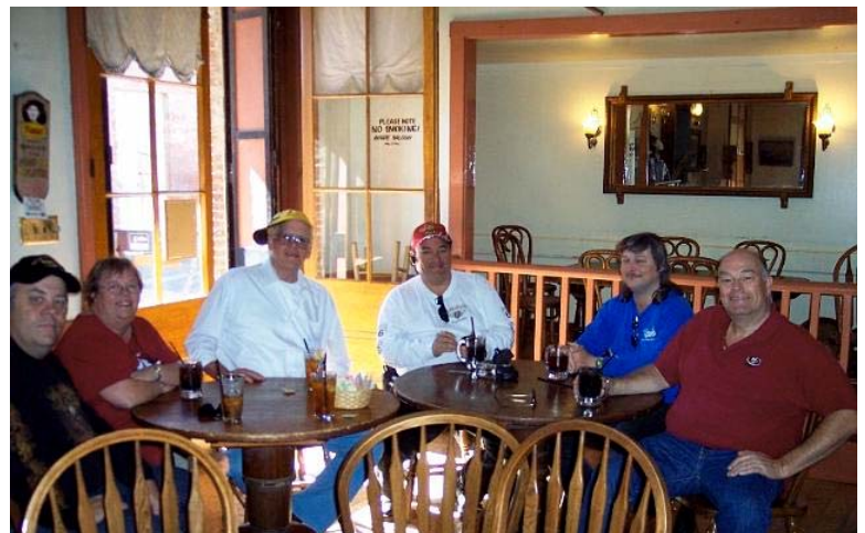
And of course, there was food involved....